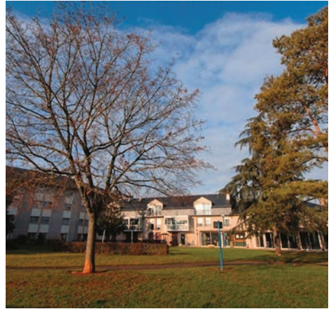
Résidence Habitat Jeunes Les Capucines 2 - Rodez Onet-Le-Chateau

CONTACT +33 (0)5 65 77 14 40 www.rodezagglo-habitat.fr