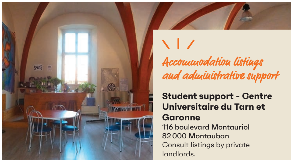
Résidence du Fort - Montauban URHAJ