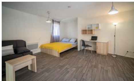
Résidence Les Triades - Promologis

https://www.habitatjeunesoccitanie.org/logement/residence-st-exupery