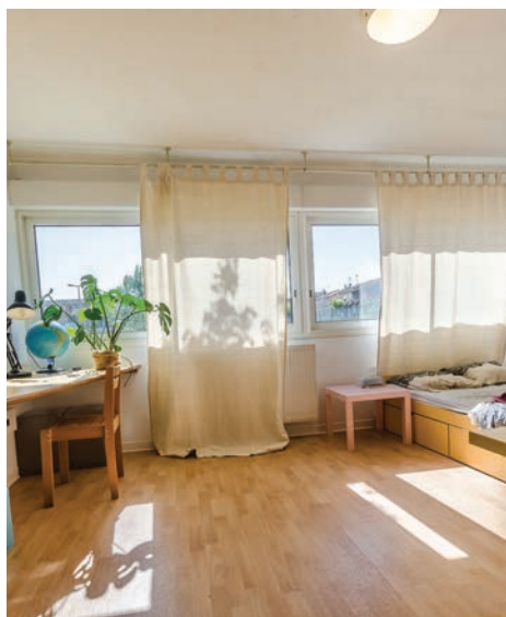
Résidence Crous L'Astrolabe